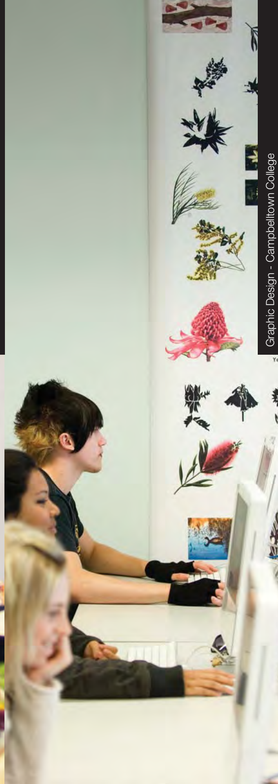
Graphic Design - Campbelltown College