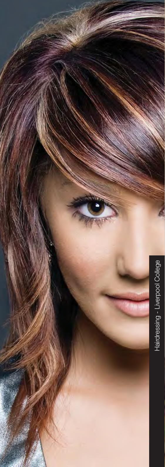
Hairdressing - Liverpool College