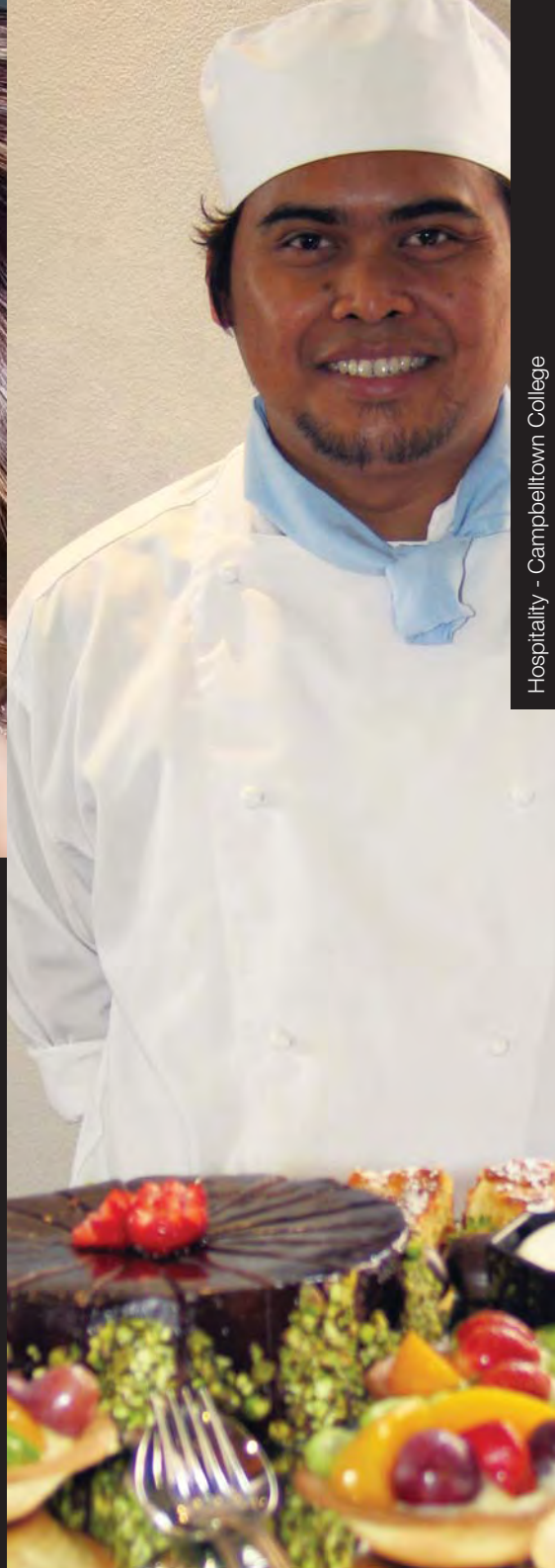
Hospitality - Campbelltown College