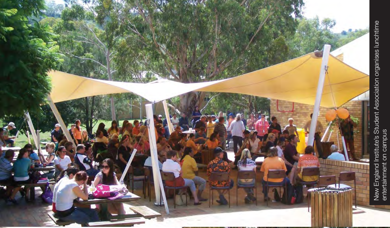
New England Institute's Student Association organises lunchtime entertainment on campus