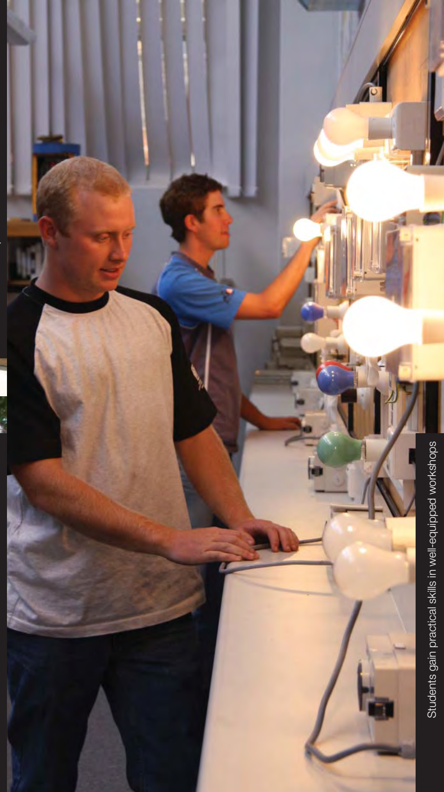
Students gain practical skills in well-equipped workshops