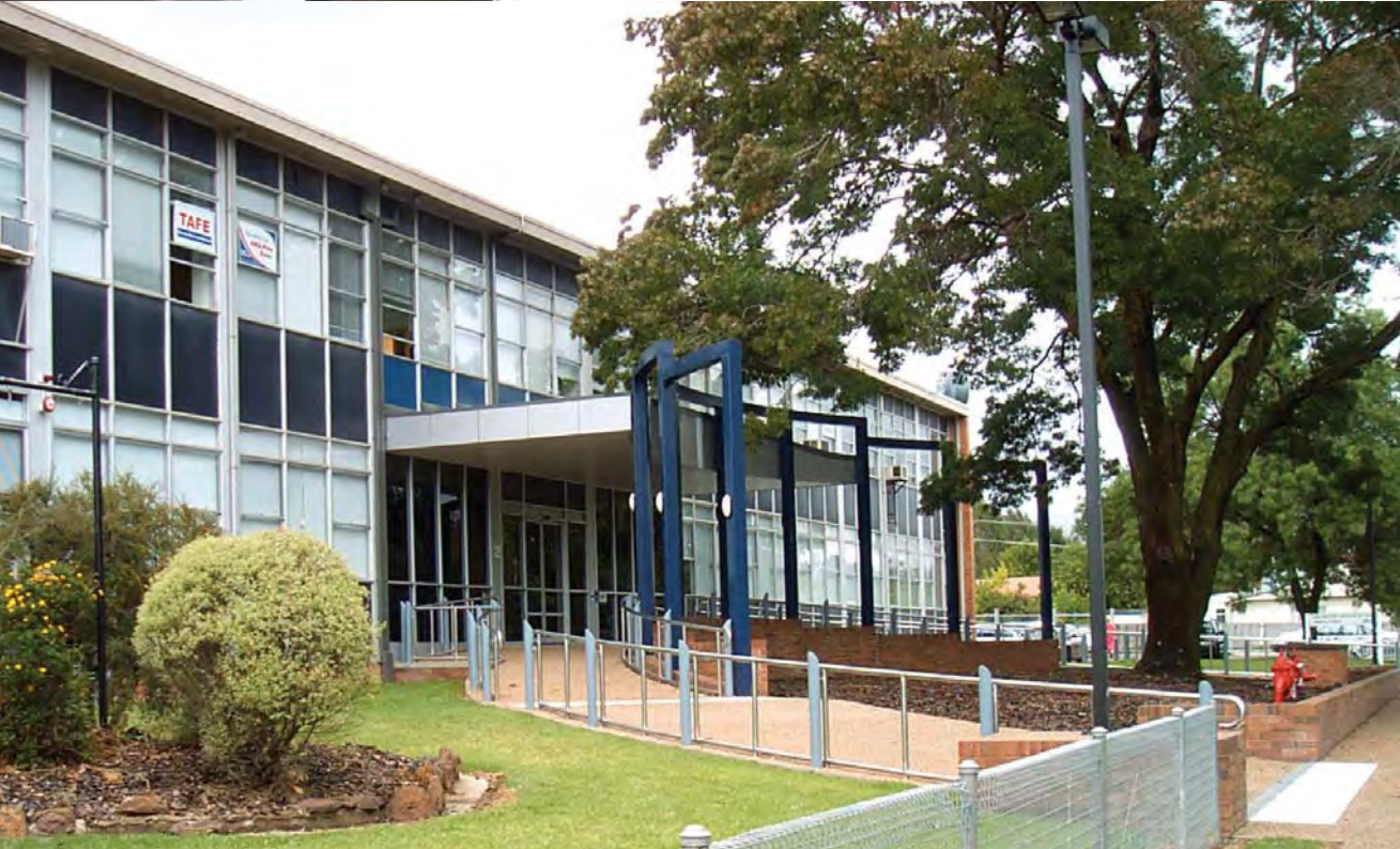
TAFE NSW Colleges are modern training centres