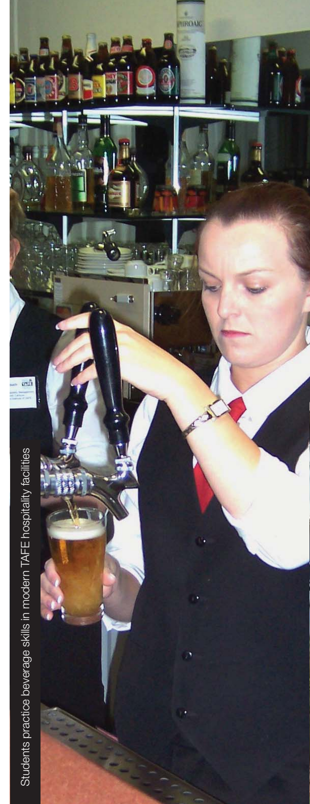
Students practice beverage skills in modern TAFE hospitality facilities

Mpilo completed the Certificate 3 in Aged Care Work and, in 2009, is studying the Diploma of Nursing. His plan is to articulate to a Bachelor of Nursing degree.