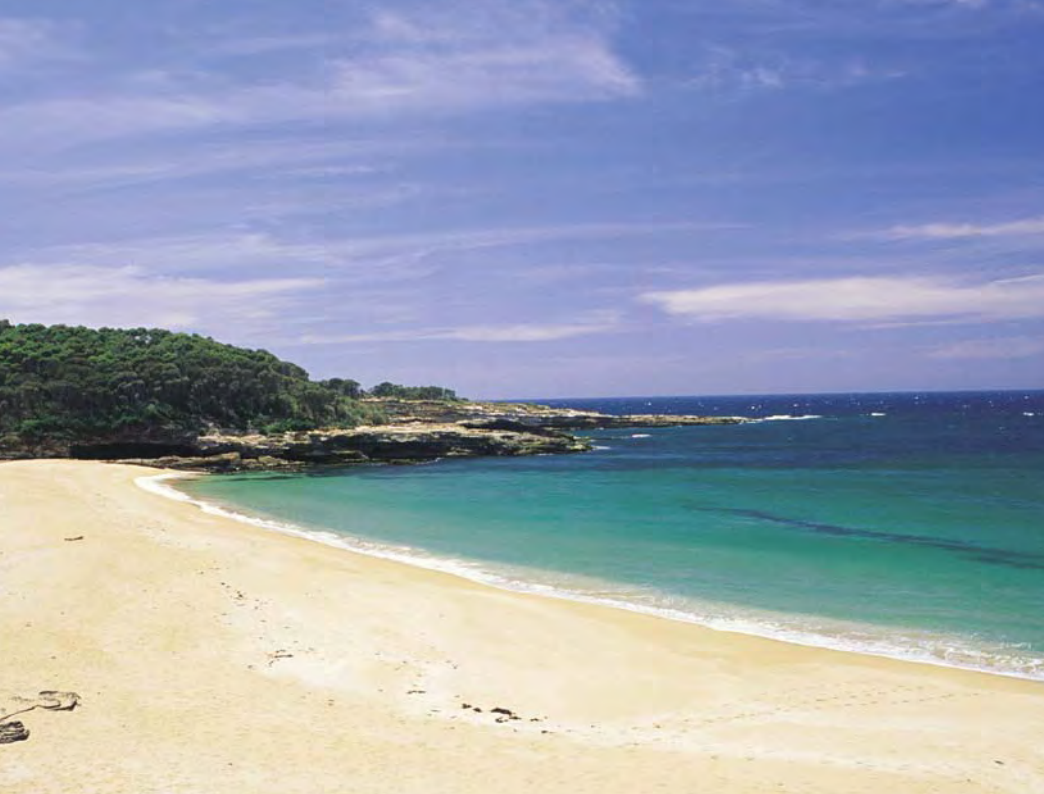
International students at North Coast Institute have access to some of the best beaches in Australia