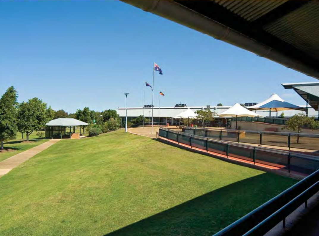
Modern Kingscliff College is close to the Gold Coast